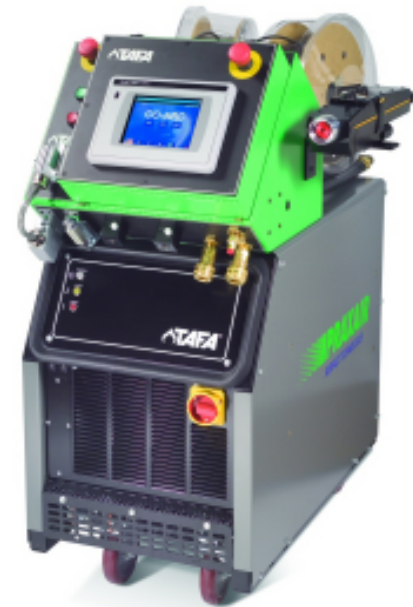
CoArc Arc Spray System Representation

As an optional feature of the new 9935 spray gun, arc voltage can be measured directly at the gun. The PLC then accurately controls proper operating voltage regardless of gun power cable length. The CoArc console has an improved air control system which allows better air flow characteristics to the gun and is closed-loop controlled.