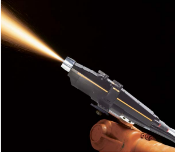
New TAFE 9935 Arc Spray Gun

For more detailed information on a gun see the specific technical data bulletins.