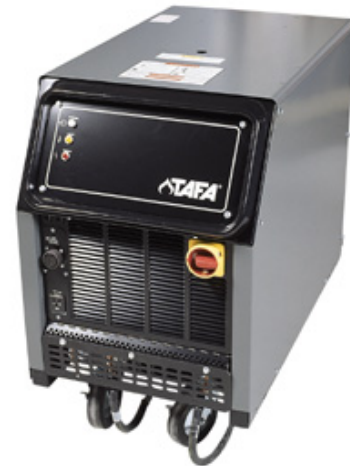
353CV Power Supply

The enhanced 353ECV power supply has the same dimensions as the standard unit but utilizes a sophisticated control board which minimizes the operating arc voltage. Lower operating voltage reduces the oxide levels within the coatings (improved particle size distribution) and increases deposit efficiency significantly (5–15%) depending on the material being sprayed. Importantly, the enhanced 353ECV power supply provides improved performance at lower voltages than conventional Arc Spray power supplies. These benefits offer the user maximum process reliability and flexibility, including a wider spray range.