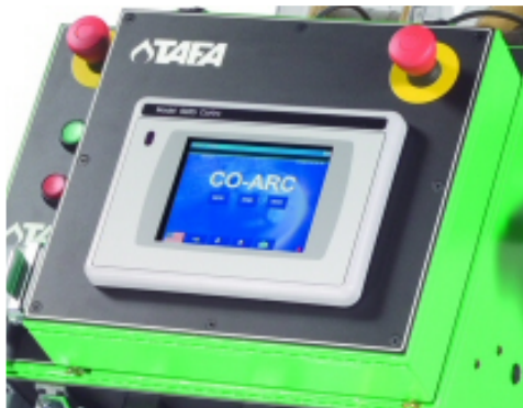
Operator Interface Terminal

The CoArc system OIT pendant is a rugged, industrial enclosure with a 7" (178 mm) color active matrix, touch-screen. The touch-screen programming is symbols-based, intuitive. This permits easy parameter set-up and monitoring that ensures consistent spray coating characteristics every time. It can operate up to 100 feet (30 meters) from the console. The OIT pendant communicates directly with a state-of-the-art PLC. The operator has the ability to view and control all parameters as well as access recipe development and maintenance scheduling directly from the OIT pendant. The program's display language can be changed by the operator.